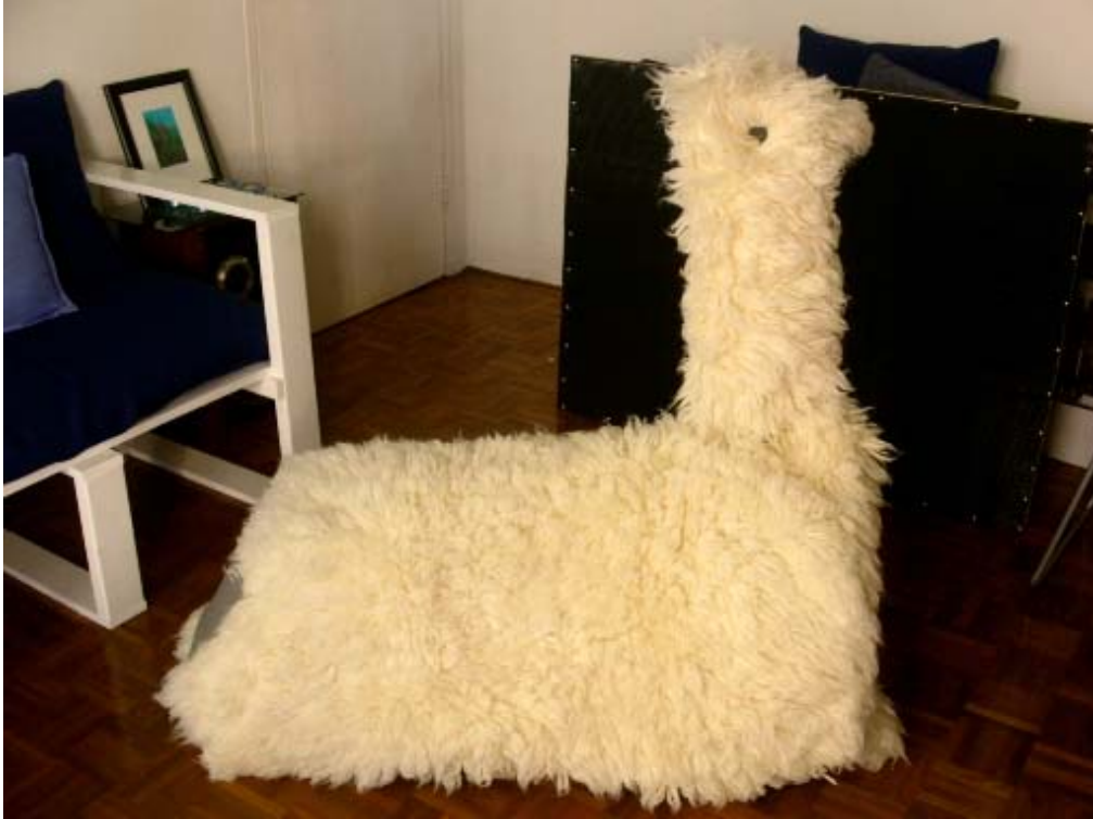
Figure 6: PC the new mannequin in the posture adopted by the female in real mating. PC has been made with a wooden frame and wire. It has internal insulation (fibre glass) and external insulation (high density foam) to avoid loss of temperature during the collection procedure. The skin is made with wool carpet and is easy to remove for convenient cleaning.