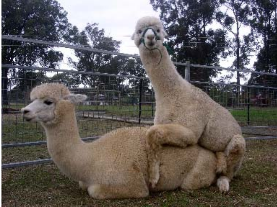
Figure 5: A natural mating, inspiration for the new mannequin that is being testing at our laboratory.