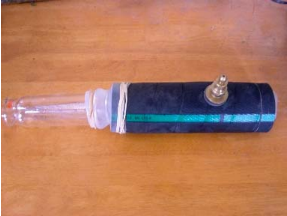
Figure 7: Current Alpaca Artificial Reproductive Tract (AART). The liner is showing in white, with the collecting tube at the end. The whole apparatus is wrapped with an electric blanket to keep it warm during the time of collection, and fitted inside the mannequin.