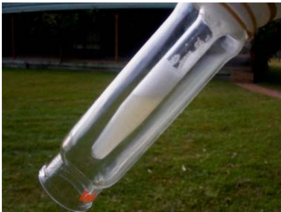
Figure 2: Collection tube showing an unusually high volume of ejaculate (6 ml), slightly milky with foam on top (contained 17 \times 10^6 sperm/ml) collected at the first attempt from Wiston, a male from La Hacienda, Marulan – NSW.

Regarding the morphometric characterization of alpaca sperm-heads, in alpacas a high degree of sperm polymorphism within and between animals